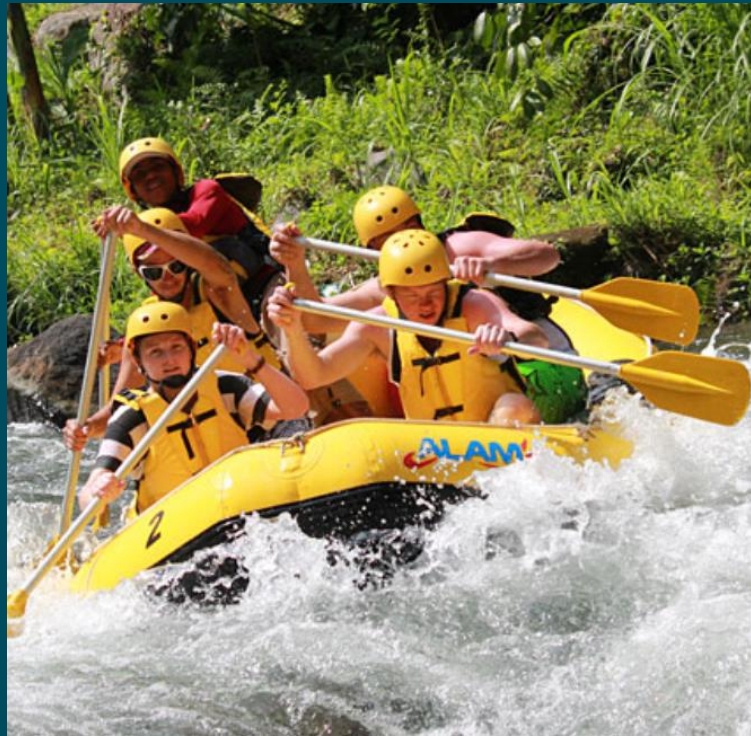
Day 5 Rafting £15