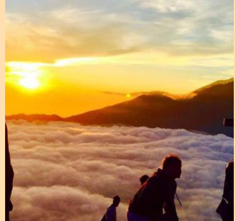
Day 6/7 Sunrise Mount Batur £30