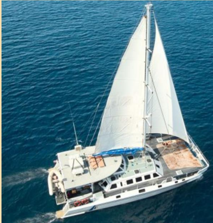
Day 4 Catamaran Sailing £35