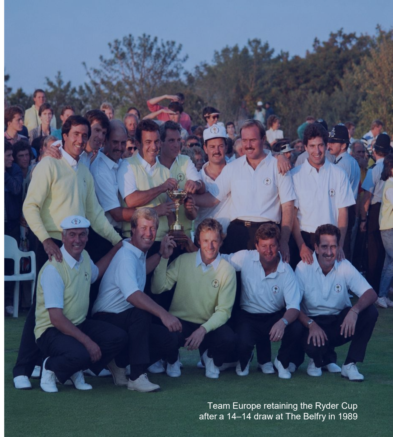
Team Europe retaining the Ryder Cup after a 14–14 draw at The Belfry in 1989

Live scoring and team leaderboards will be available via Golf GameBook