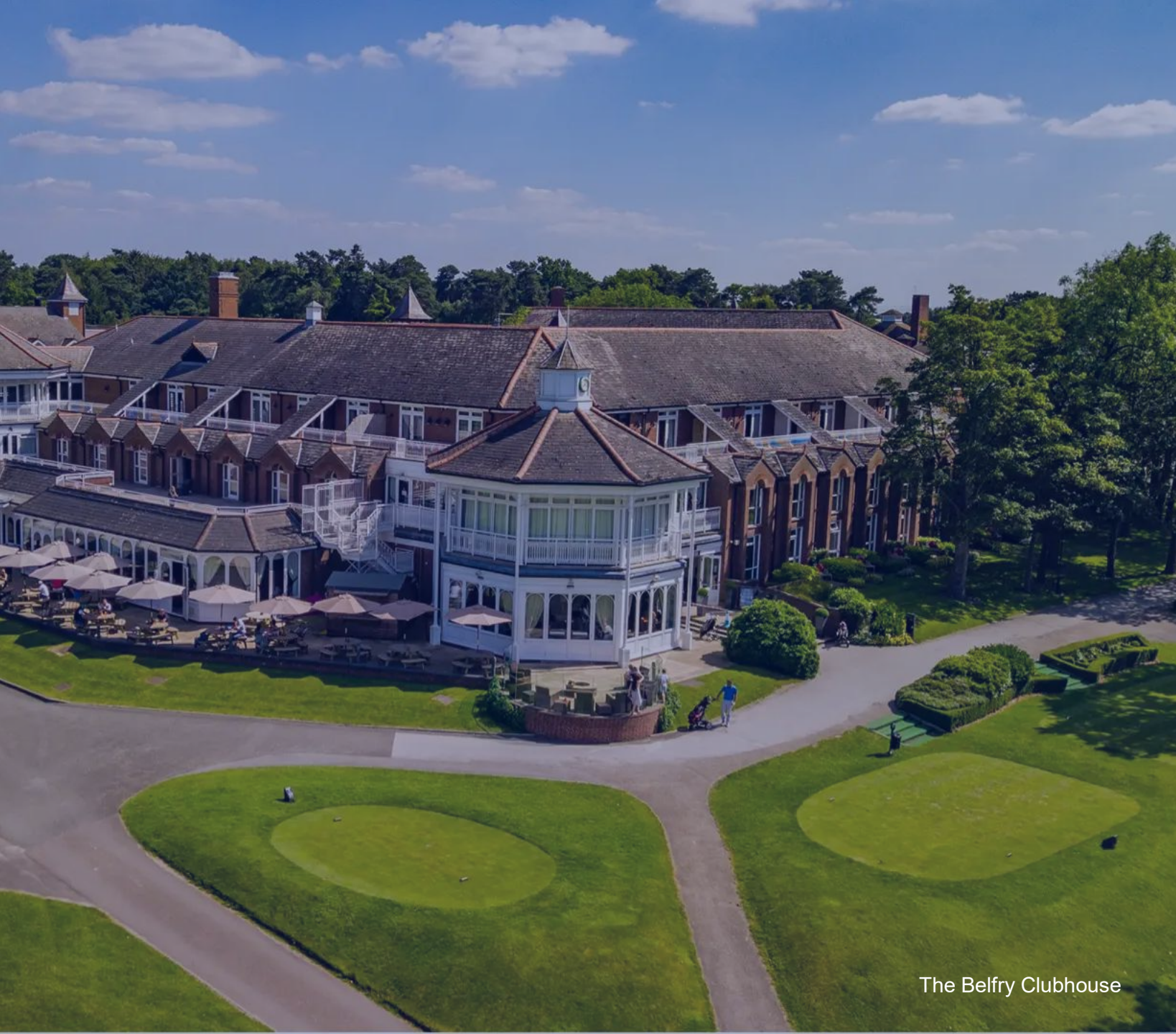
The Belfry Clubhouse