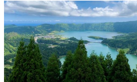
Lagoa 7 cidades