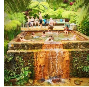
Poça da dona beija