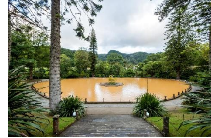
Parque Terra Nostra